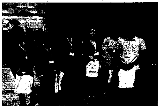
A group of 8 th grade students participated in the Welch Allyn Manufacturing Careers Day on October 4, 2013.

Annual Career Fair for students in grades 7 and 8 will be on March 19 th this year. I am looking for parents and community members to participate by representing various careers so that our students can practice their interviewing skills and learn about local career opportunities.